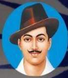
Shaheed Bhagat Singh

"शहीदों की विरासत, युवा शक्ति का प्रभाव - विकसित भारत का निर्माण"