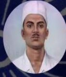
Shaheed Sukhdev Thapar