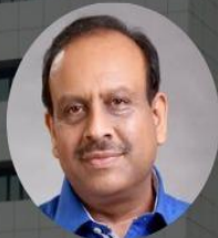
Shri Vijender Gupta Ji

Hon'ble Speaker, Delhi Legislative Assembly